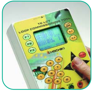
TE-LCT Loop Commissioning Tool