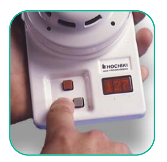
TCH-B100 Hand Held Device Programmer